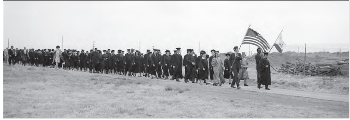
June 1970: Graduating seniors and faculty parade past dirt mounds on their way to the first commencement on the permanent campus.