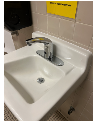
New water efficient sink installed