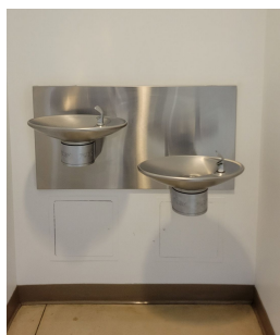
Water fountains on the 5th floor of FZVLSU

While all stateside campus water fountains have already been retrofitted to include a bottle filler/hydration station to enable users to refill reusable water bottles easily, the Loker Student Union (LSU) still has two water fountain locations that do not have a bottle filler. This application proposed providing a bottle filler fountain to replace the ground floor location to ensure 100% coverage for bottle fillers on campus. Based on this application, a bottle filler unit was purchased and delivered to the LSU facilities team for install on the ground floor to provide this service to campus users.