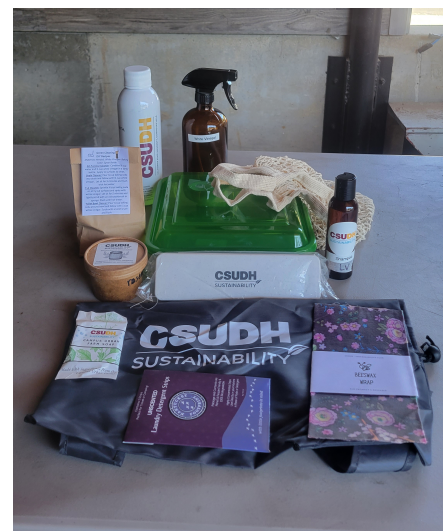
Assembled emergency housing kit

This project proposed adding examples of how to live more sustainably into a demo dorm room. This was adapted to provide green living welcome kits to in-need students moving into temporary/emergency housing units at Housing Phase I/II. These kits (30 of which were distributed at the beginning of summer 2023, and another 30 of which were distributed at the start of fall semester 2023) provide green cleaning tools, reusable utensils and beeswax wraps, eco-friendly hygiene items (plus access to DIY recipes), Toro Token containers, and more to meet essential needs while also supporting an eco-friendly lifestyle for recipients. Supplies were funded directly by the Office of Sustainability and leveraged the TGIF funded Toro Token Container project (end of this report).