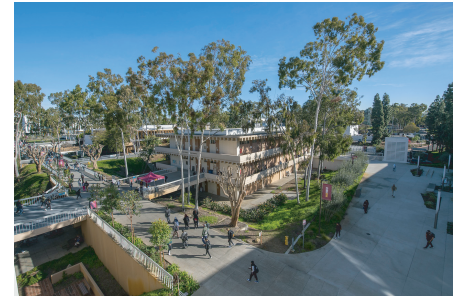
Eucalyptus trees surrounding the NSM building.

This application proposed replacing dying eucalyptus trees near the Natural Science and Mathematics (NSM) building with California native trees. As the campus has already committed funding to taking down hazardous eucalyptus trees and replacing them with new more appropriate trees in that area, the Office of Sustainability will add $600 to its tree re-planting fund/efforts in Fall 2023.