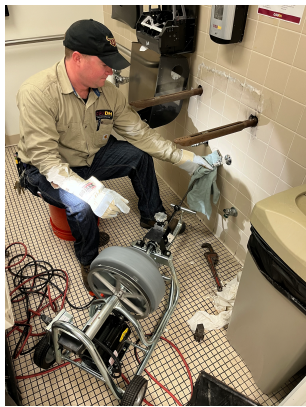
Plumbers working on the retrofit

This project proposed supporting installing water efficient fixtures on campus to help conserve campus potable water usage. $500 was awarded out of the Toro Green Initiative Fund to support a pilot project to retrofit one of the Student Health Center bathrooms with water efficient fixtures. Renco Sales donated a water efficient sink to the project, and Facilities Services covered labor costs and remaining parts to cover the retrofit project. As a result, the bathroom was upgraded with a water efficient sink which will become the new standard for the remaining bathrooms in the building and future retrofits if successful/well-received by building users.