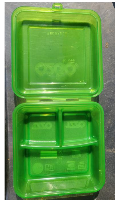
Toro Token container

These containers have been included in the emergency housing welcome kits (previously referenced project in this report) greeting in-need students moving into temporary/emergency Housing, and the remaining quantities will be provided to Basic Needs at their physical location when ready in fall 2023 to further support utilization.