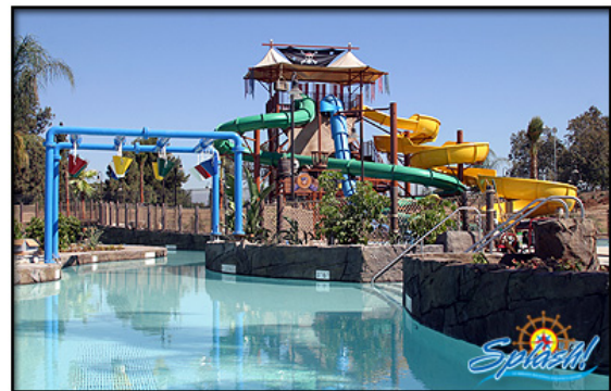
September 10, 2007

The building design was developed by the architectural firm of Westberg-White, which also designed the nearby Activity Center and Resource Center buildings. Plans for the Aquatic Center’s pools, waterpark and spa area were developed by the aquatic design firm of Counsilman-Hunsaker. California Commercial Pools constructed the various pools at the facility. The project management was provided by C.W. Driver.