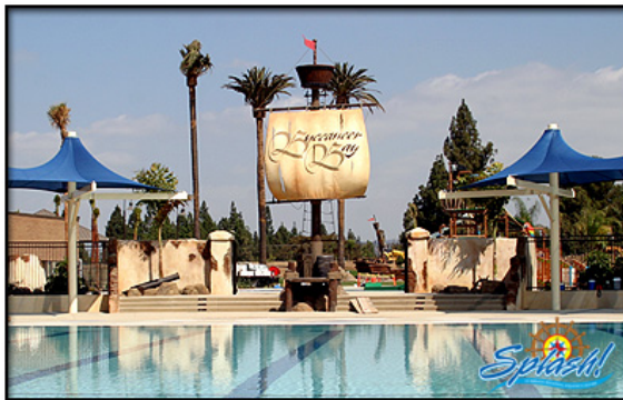
September 17, 2007

The family-fun oriented “Buccaneer Bay”, combines the excitement of a water park with the type of decorative pirate features found in a theme park. Buccaneer Bay features a flowing river channel, three water slides, a children’s interactive play structure, zero-depth beach entry and two spray pad areas. Pirate themed elements include: a marooned ship, a dramatic skull rock, shade canopies that resemble sails, cannon walls, wharf plank benches, and crow’s nests.