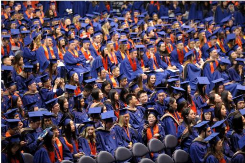
Graduates of the Gies College of Business at the University of Illinois

Applications to full-time M.B.A. programs have been falling in the strong job market, leading business schools to shift resources online