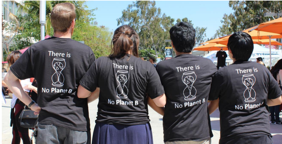
Culture Shift/Core Value