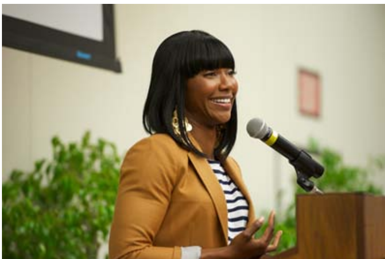
Carmelita Jeter speaks to students, faculty, staff and the Carson community.