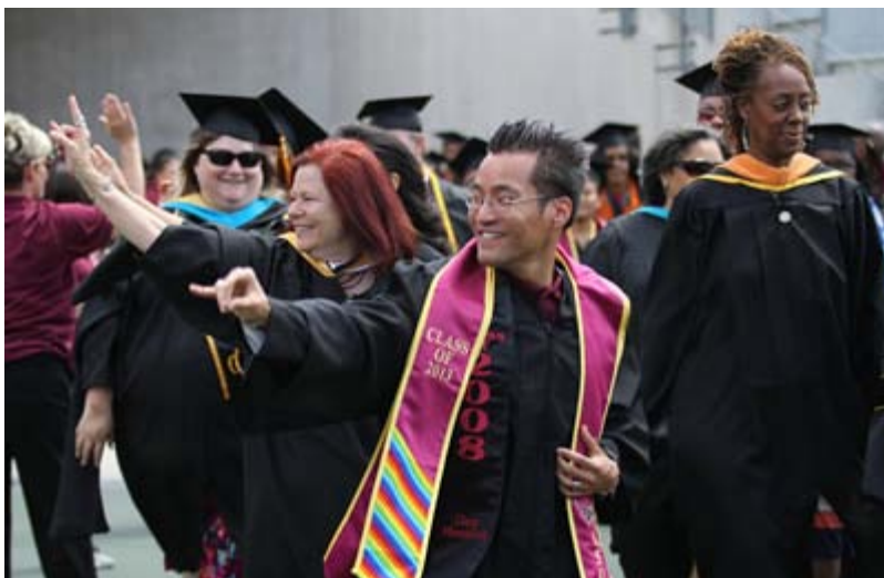
2013 Alumni Processional

Whether recapturing the cap-and-gown experience, making up for a missed opportunity to participate in commencement, or reconnecting with the university and former classmates, 54 California State University, Dominguez Hills alumni gathered in full regalia on May 18 to lead the 2013 graduates from the College of Arts and Humanities and College of Extended and International Education into the Home Depot Center Tennis Stadium.