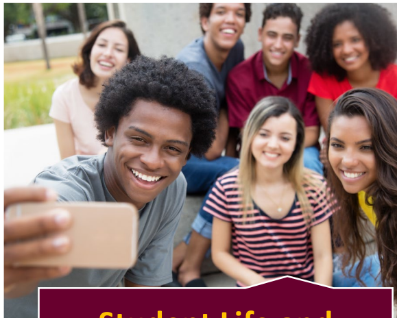
Student Life and Engagement