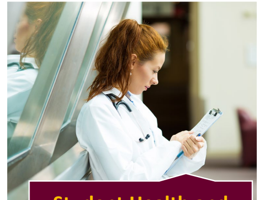
Student Health and Psychological Services