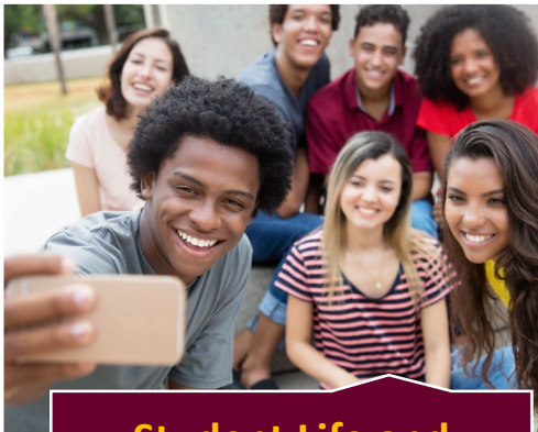
Student Life and Engagement