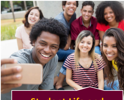
Student Life and Engagement