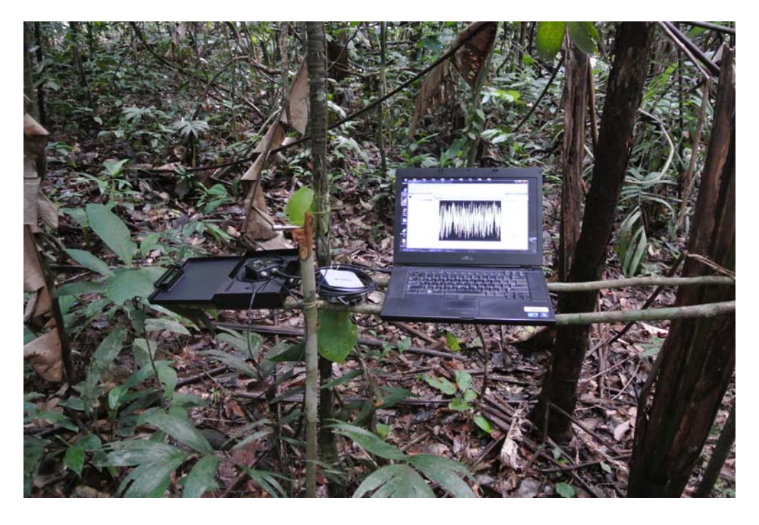
Fig. 4. Infrasonic measurements within the Caura rain forest.