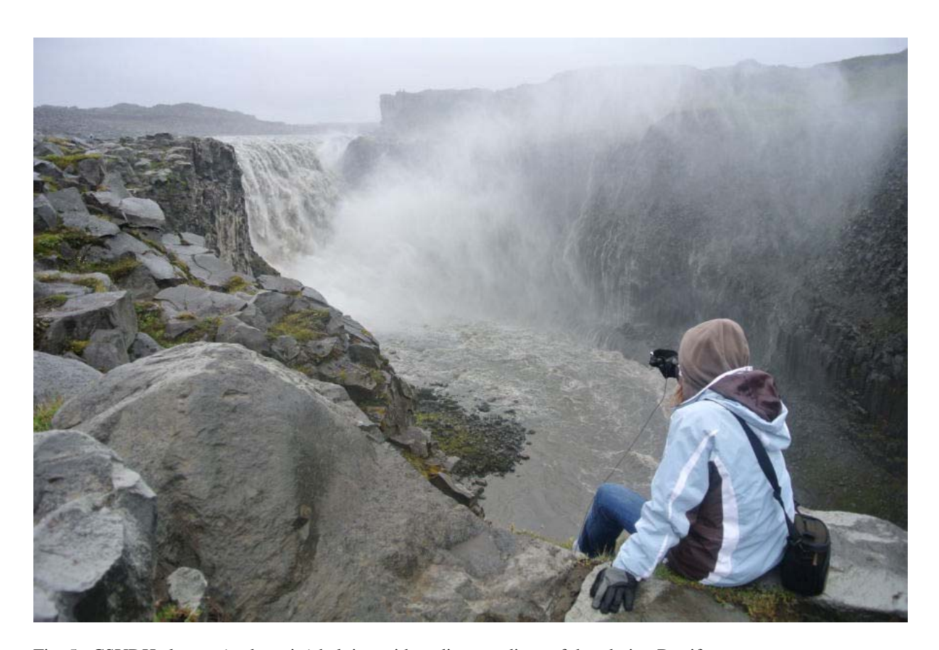
Fig. 5. CSUDH alumna (and tourist) helping with audio recordings of thundering Dettifoss.

On August 5 I returned to the field, to the dramatically different setting of Iceland. During a ten day tour, I dispatched the audio equipment at a diverse set of waterfalls on the rugged island. Most notable of these was the Dettifoss cataract (Fig. 5), the most powerful waterfall in Europe. Infrasound measurements were also conducted at upstream Sellfoss (Fig. 6), distant Skogafoss, and the famous Godafoss (Fig. 7) waterfalls.