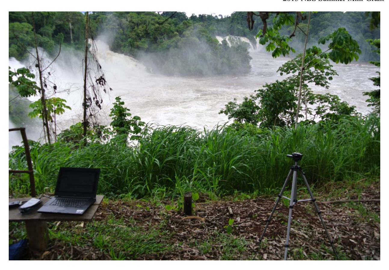
Fig. 3. Audio measurements at the edge of Las Pavas Falls. The waterfall is broad (700 m), so only a portion of the total falls comprising the drop in the Rio Caura are visible.