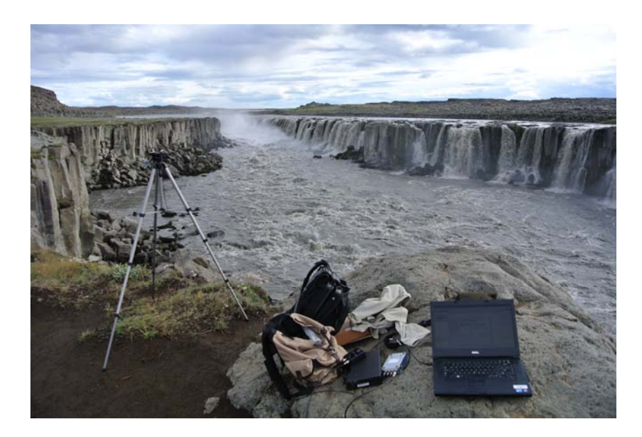
Fig. 6. Measurement site for the elongated Sellfoss waterfall.