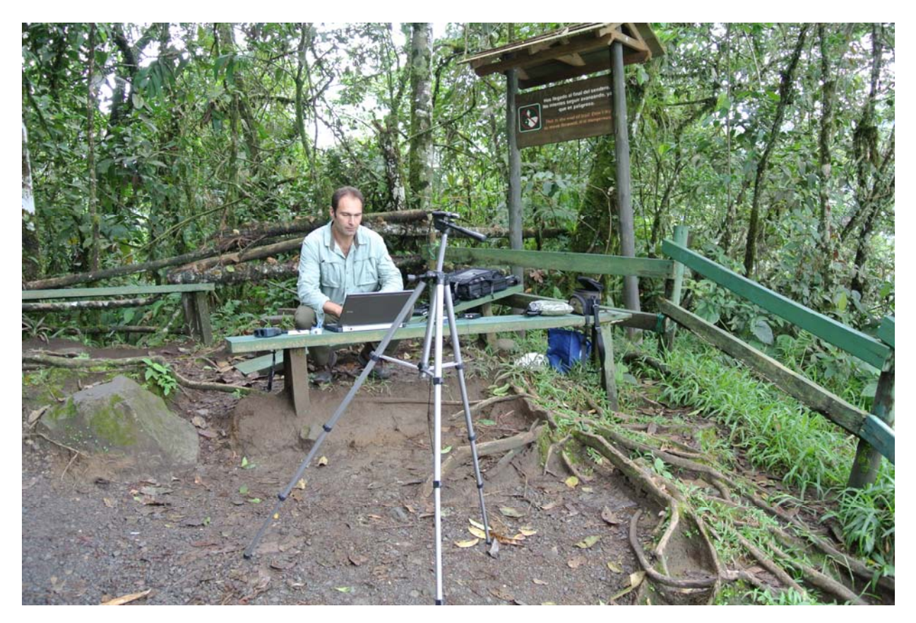
Fig. 1. Field measurements in Ecuador. The small, ½" microphone is mounted on the tripod, and recordings are being written to the laptop computer.

On July 7-11, 2013, the microphone, a data logger, and laptop computer were taken to Ecuador to measure the infrasound from San Rafael Falls, an impressive double plunge waterfall in the Ecuadorian rain forest (Figures 1 & 2). Unfortunately, this iconic fall—the largest waterfall of Ecuador—will effectively disappear in a national hydropower project slated to go online within the next 0-2 years. This made the audio measurements during the 2013 rainy season all the more precious.