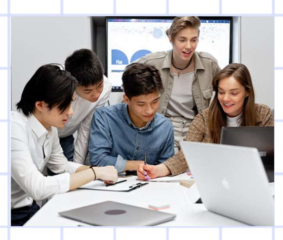
Think Tank session with senior leaders and peers.