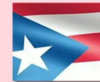
Socorro Valle Puerto Rican