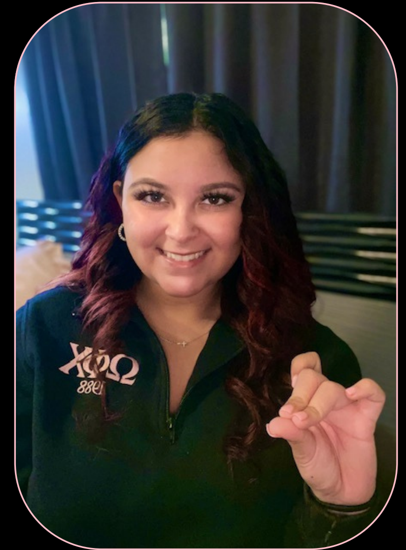
National Director of Recruitment Strategy