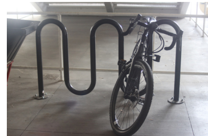
New bicycle rack at Welch Hall

This application proposed a general increase in the amount of green infrastructure on campus. Based on further discussion with the awarded student, they opted to apply the TGIF award towards a new bicycle rack on campus. This was placed at the base of the Welch Hall stairs, a high-demand area, outside the Claudia Hampton Lecture hall in spring semester 2021.