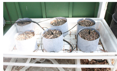
Aquaponics system at the CSUDH Campus Urban Farm

This application offered to purchase and install a small aquaponics system at the Campus Urban Farm to further its demonstration growing technology displays and increase productivity. The awarded funds supported the purchase of materials, enabling the student to set up and install the aquaponics system. As of fall 2022, the system is currently supporting a crop of lettuce which has successfully yielded harvests to feed in-need students via the campus food pantry areas.