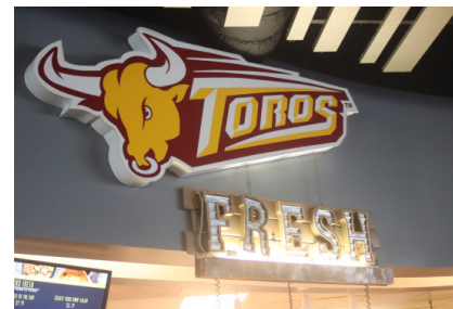
Toro Fresh: One of the many eateries in the Loker Student Union

This project proposed piloting reusable utensils in the Loker Student Union food court. Based on the conditions at the time, the team agreed with Dining to procure an according amount of reusable utensil sets for giveaways to help promote reusable cutlery use by students.